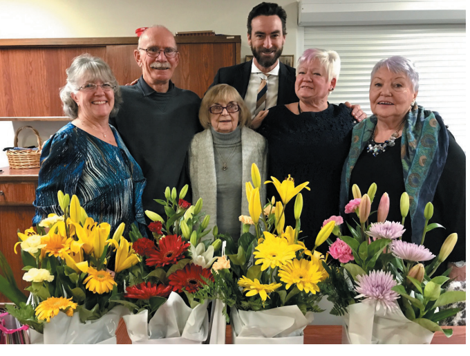
I joined the outgoing Maylands Autumn Club committee at the club's final morning tea after more than 50 years of service to the community.