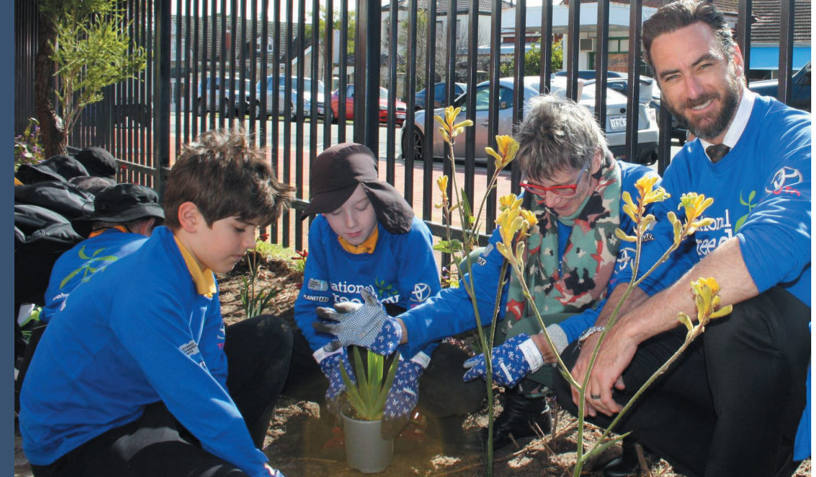
I rolled up my sleeves and got my hands dirty planting trees with the students at Highgate I was blown away by the stamina and courage of this year's Avon Descent participants, Primary School and the team from City Toyota who sponsor Planet Ark's National Tree Day. and had the great privilege of awarding medallions at the finishing line.