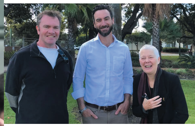
There was a fantastic response to my mobile office in Mount Hawthorn earlier this month. I was able to discuss local community issues and heard some great ideas from local community members.